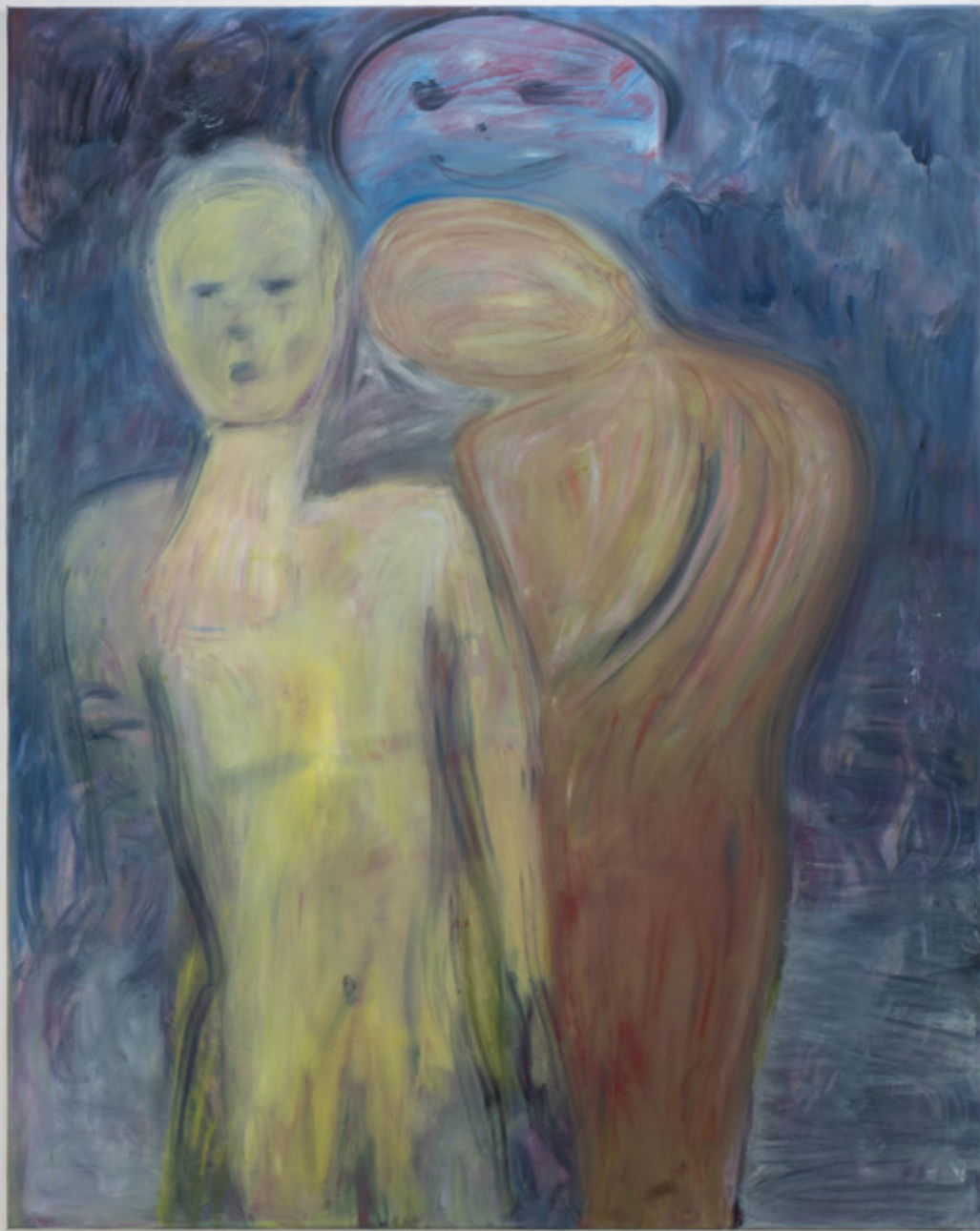
Serenity II , 2024, Oil on canvas, 200 x 160 cm.