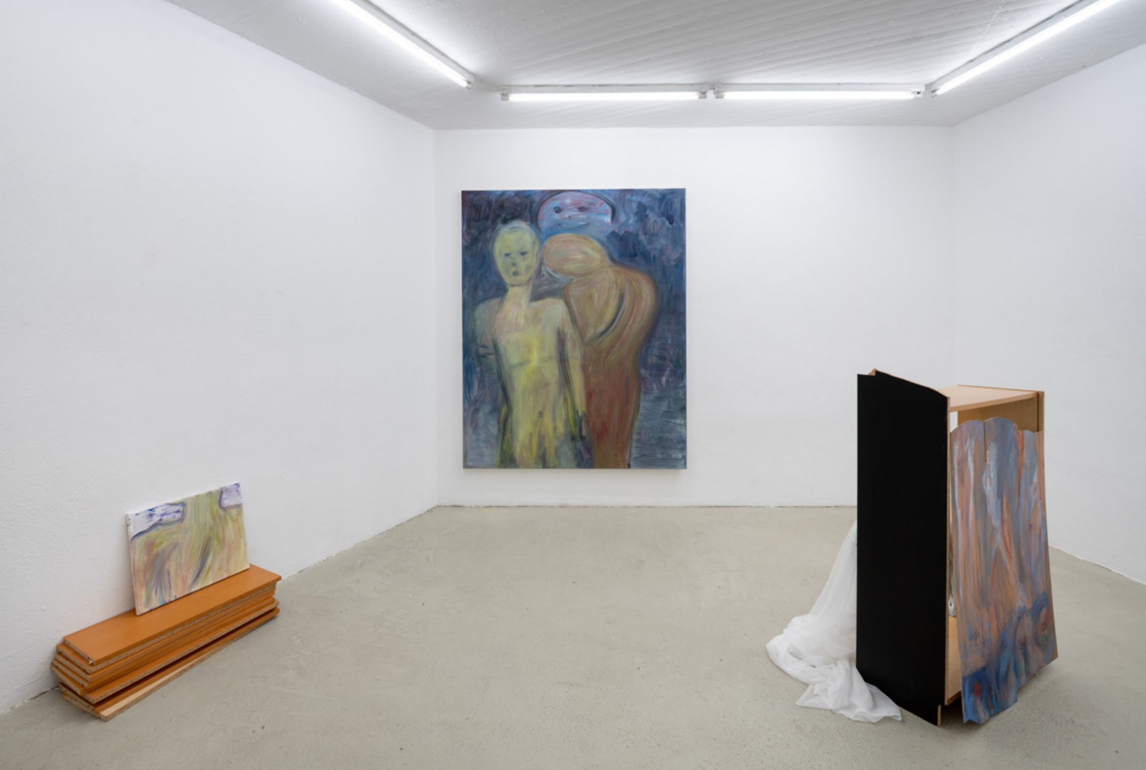
Exhibition view, NOT QUITE A LOVE POEM, Mouches Volantes, Cologne.