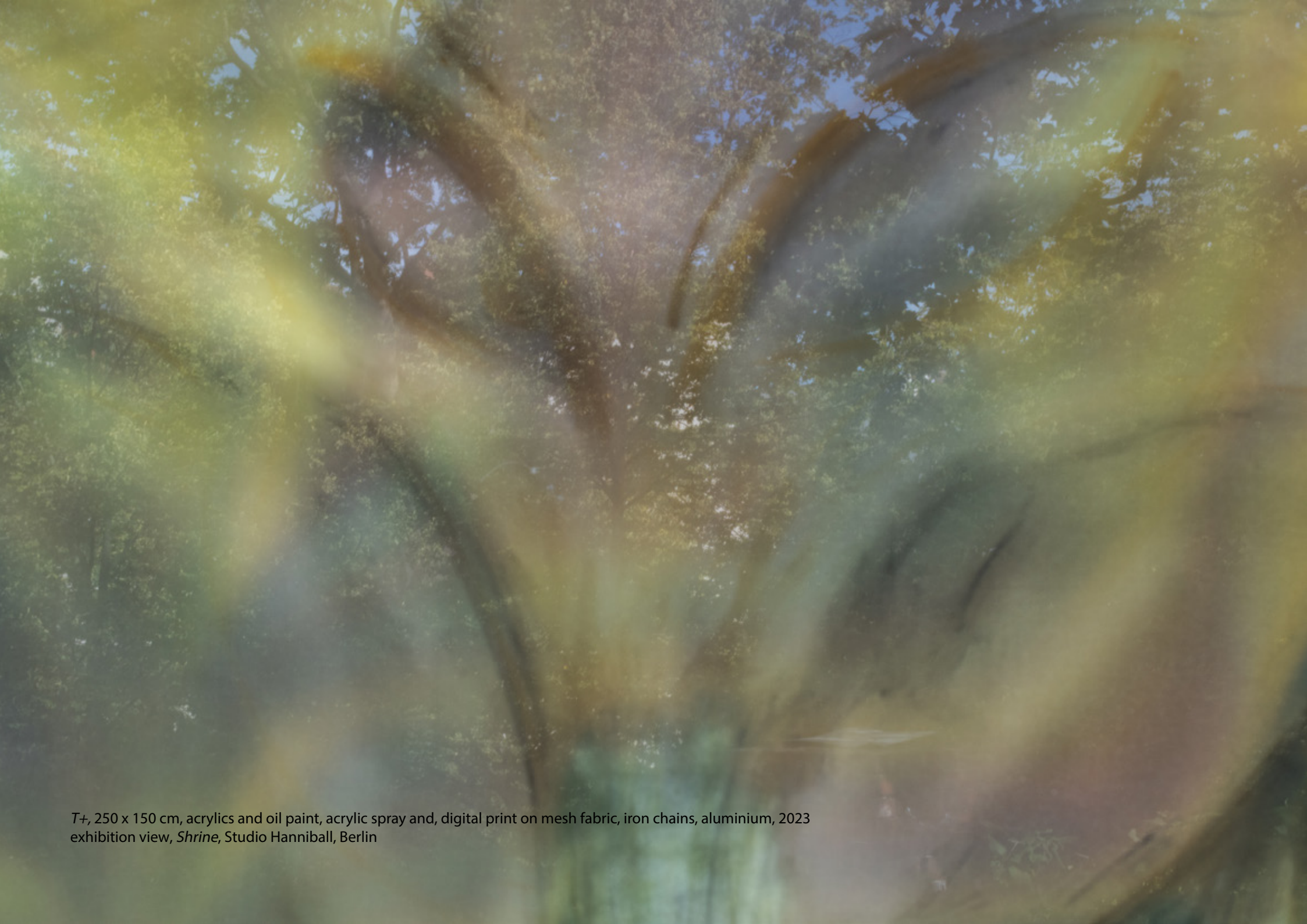
T+ , 250 x 150 cm, acrylics and oil paint, acrylic spray and, digital print on mesh fabric, iron chains, aluminium, 2023 exhibition view, Shrine , Studio Hanniball, Berlin