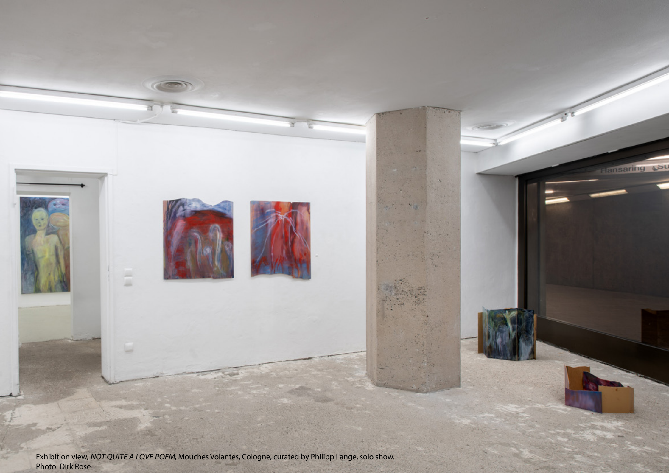
Exhibition view, NOT QUITE A LOVE POEM , Mouches Volantes, Cologne, curated by Philipp Lange, solo show.