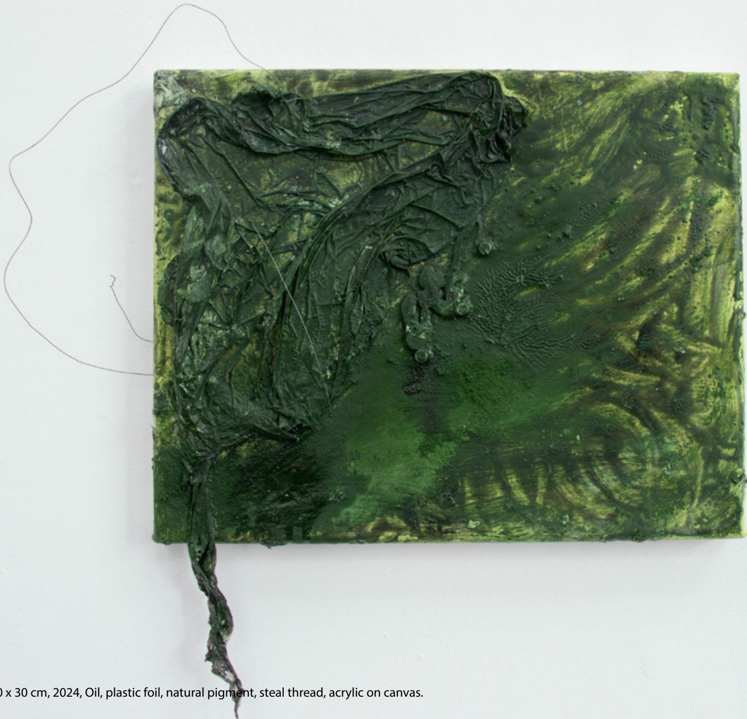
Moss , 20 x 30 cm, 2024, Oil, plastic foil, natural pigment, steal thread, acrylic on canvas.