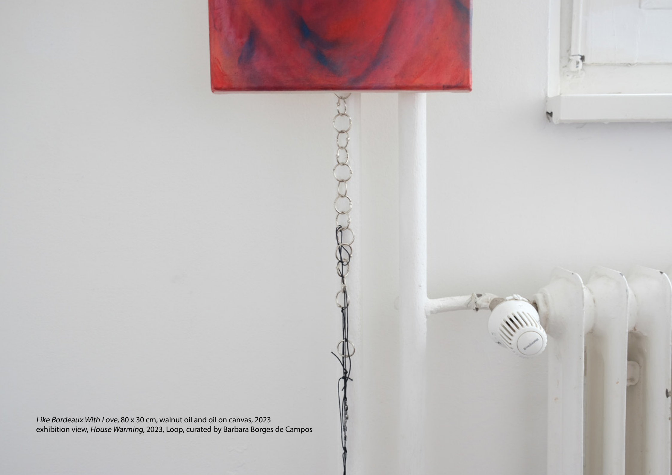
Like Bordeaux With Love , 80 x 30 cm, walnut oil and oil on canvas, 2023 exhibition view, House Warming , 2023, Loop, curated by Barbara Borges de Campos