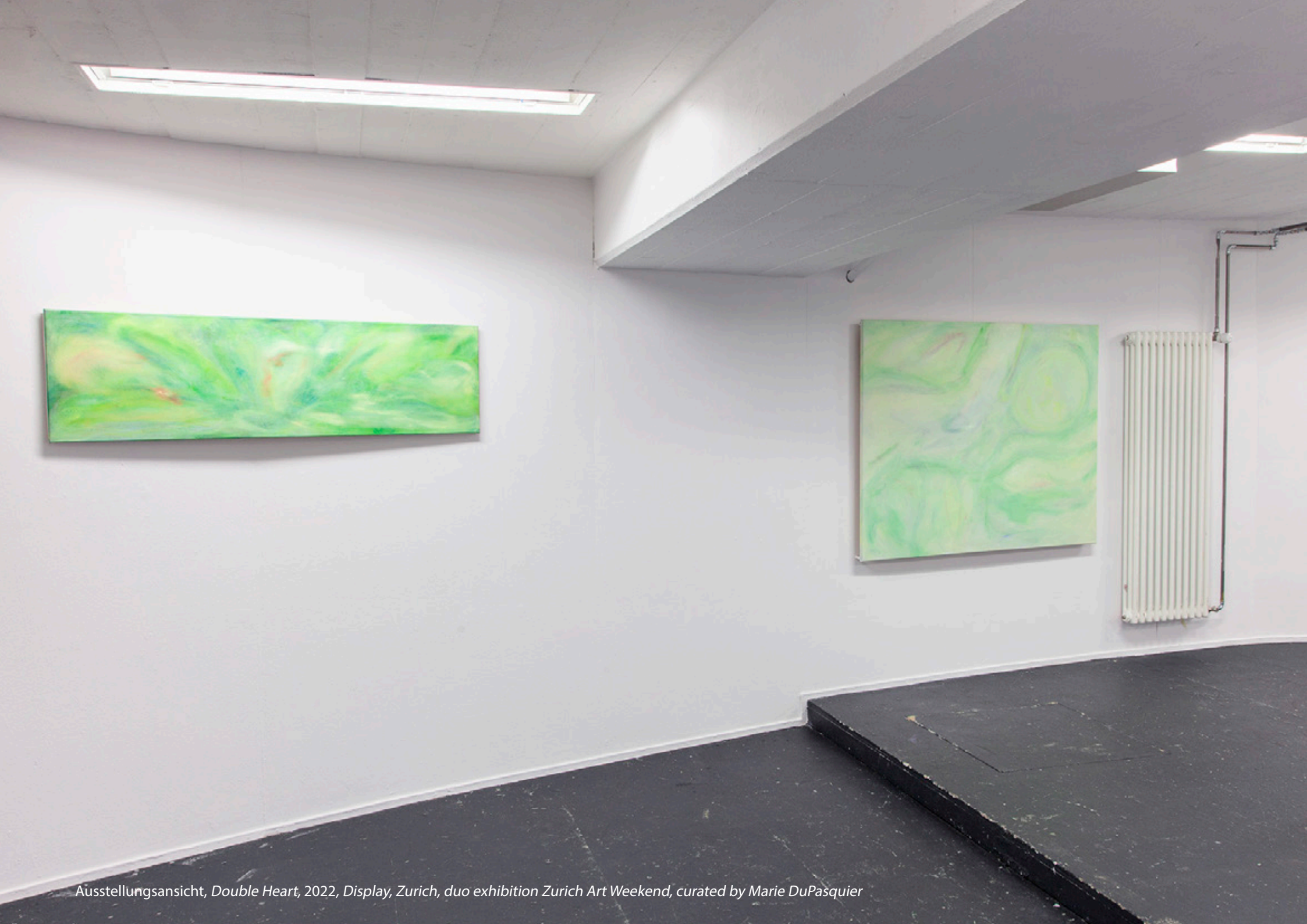
Ausstellungsansicht, Double Heart , 2022, Display , Zurich, duo exhibition Zurich Art Weekend, curated by Marie DuPasquier