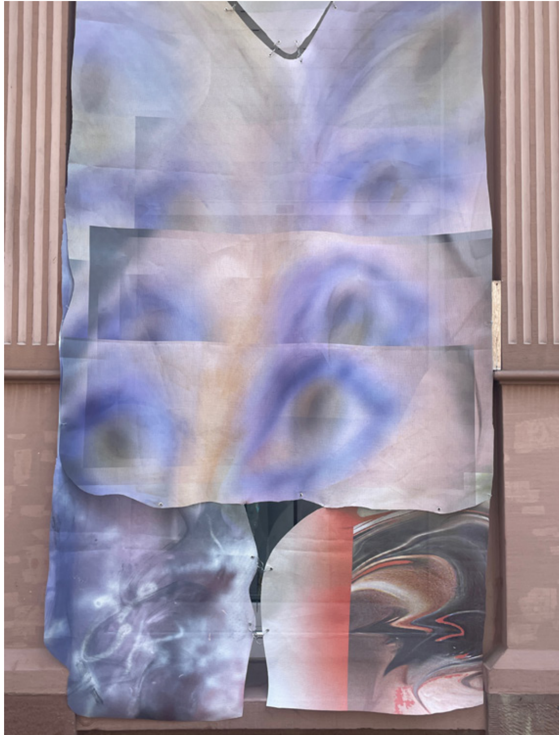
S-e-e-d-s, 300x120cm, Acrylic and oil paint, acrylic spray, digital print on mesh fabric, steel chains, aluminium, 2023 (exhibition venues in public space in Freiburg) Exhibition view, Das Lied der Straße , Biennale für Freiburg 2