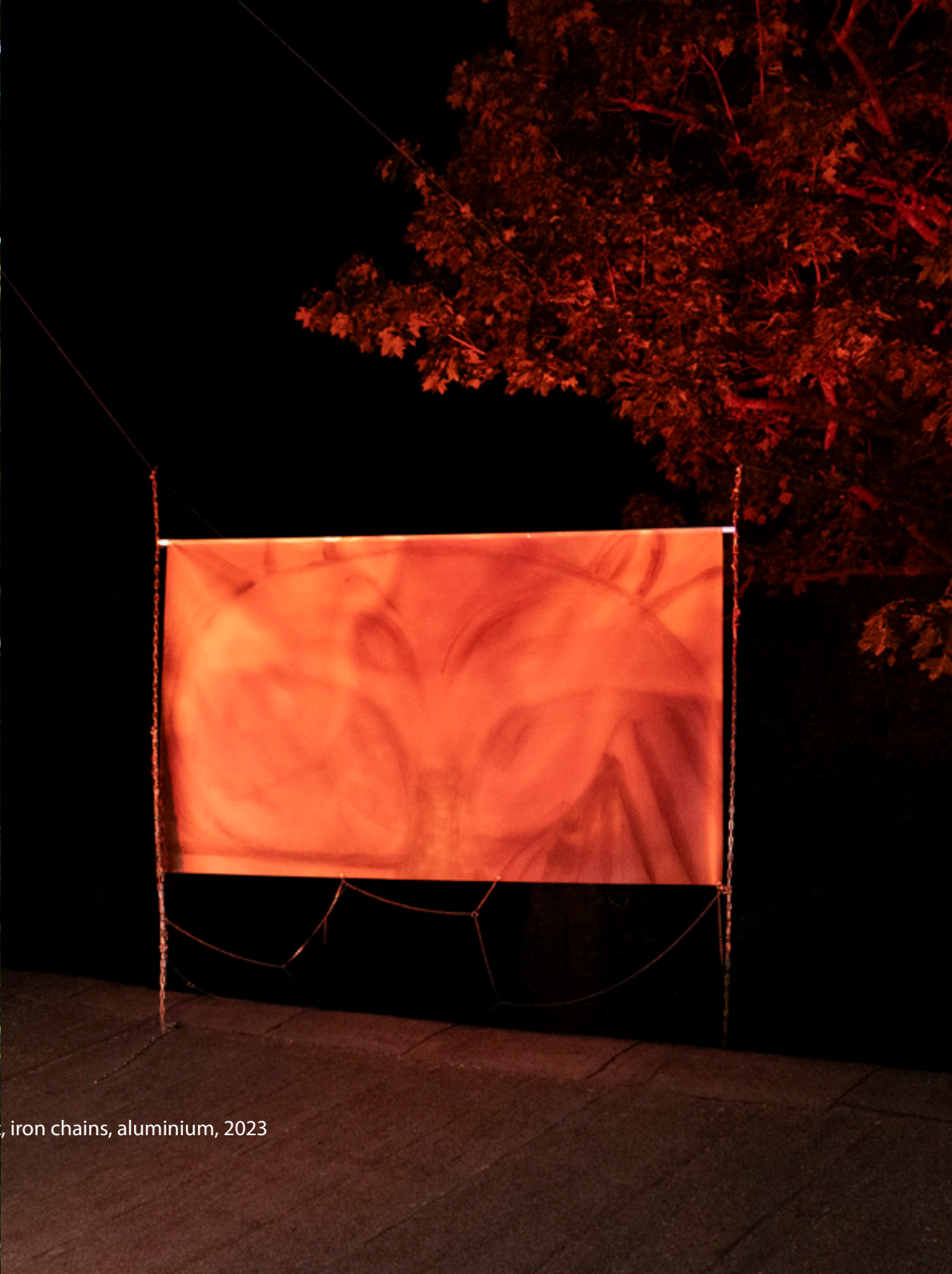
T+, 250 x 150 cm, acrylics and oil paint, acrylic spray and, digital print on mesh fabric, iron chains, aluminium, 2023 exhibition view, Shrine , Studio Hanniball, Berlin, (day/night view)