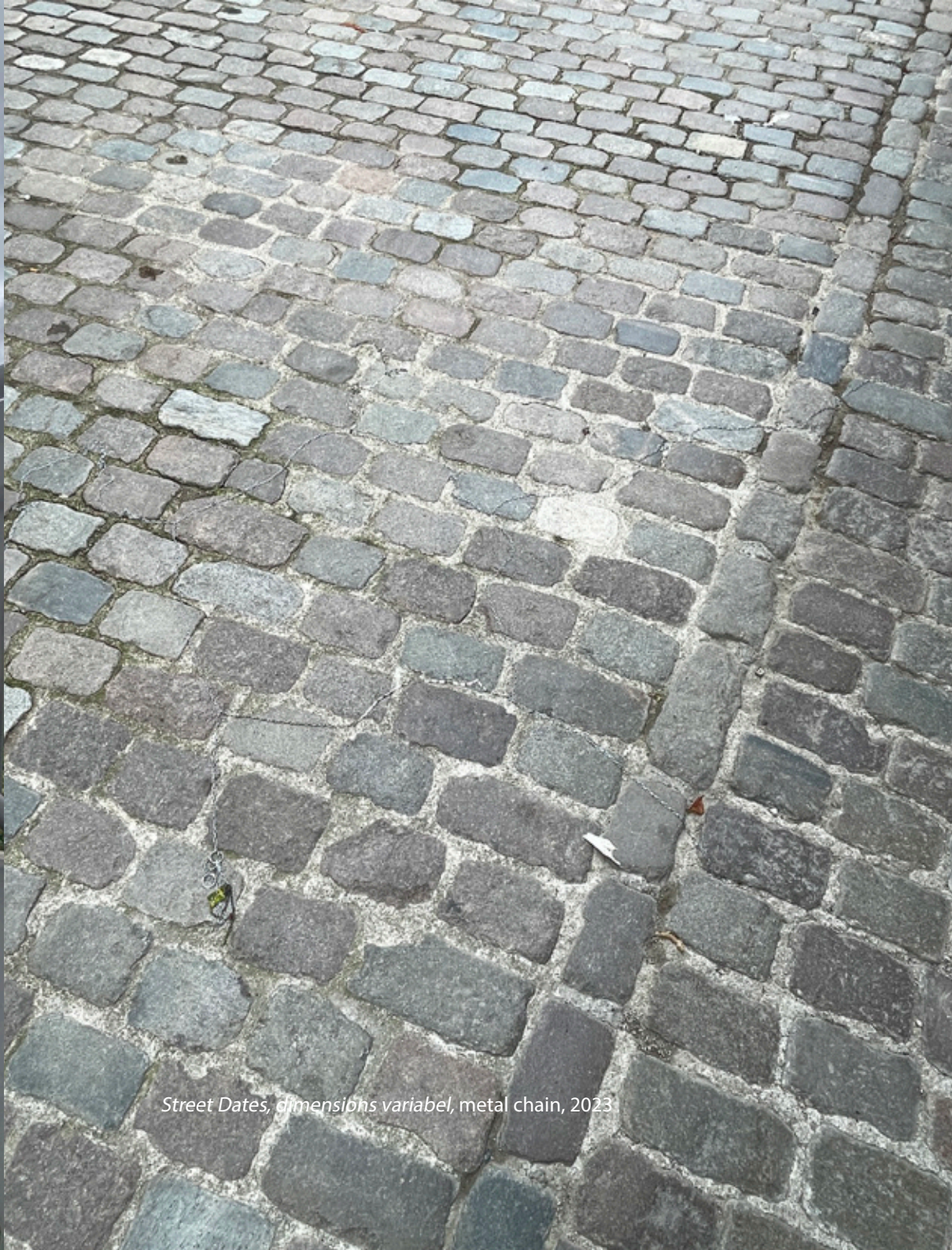
Street Dates , dimensions variabel, metal chain, 2023