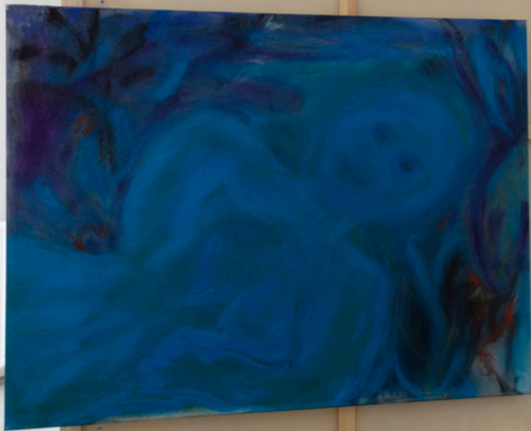
Seconds Afar , 110 x 150 cm, Oil on canvas,, 2022. Photo: Chroma exhibition view, Darling You Should Be Lucky , 2022, Display , Berlin, solo exhibition curated by Marie DuPasquier