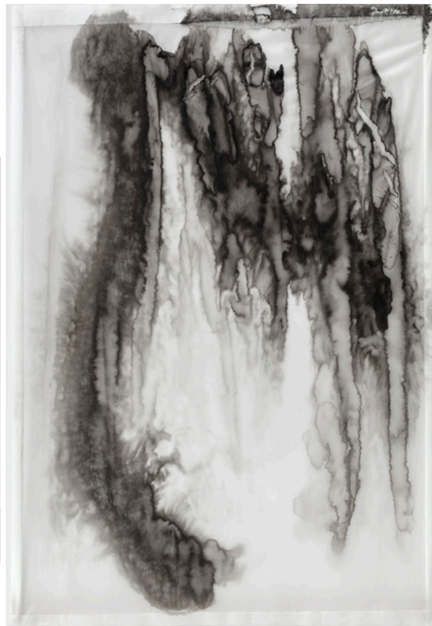
Real, Loved and so Very Alive (no. 37) , 29,7 x 42 cm, ink on paper, 2022 (right)