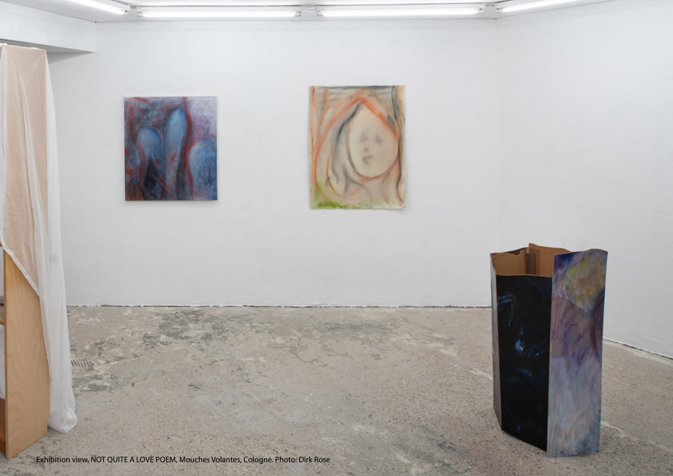
Exhibition view, NOT QUITE A LOVE POEM, Mouches Volantes, Cologne.