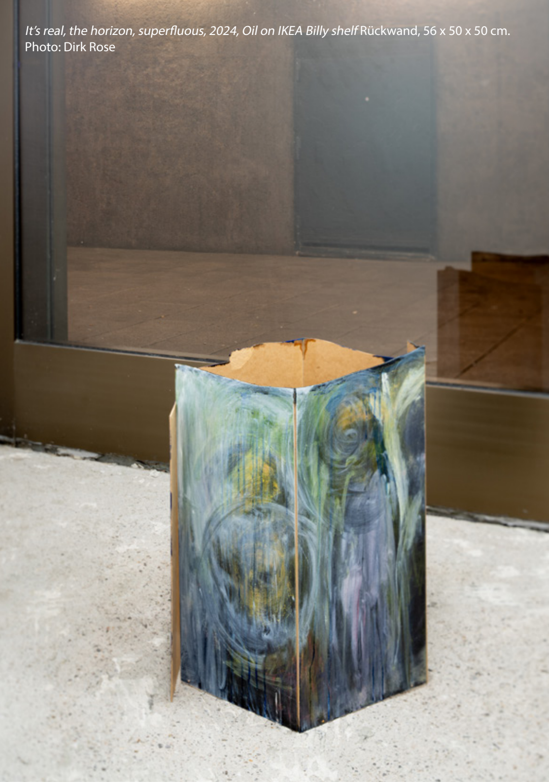
It's real, the horizon, superfluous, 2024, Oil on IKEA Billy shelf Rückwand, 56 x 50 x 50 cm.