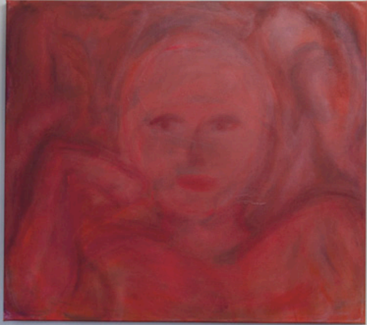
It Will (Not) Disappear , 80 x 90 cm, walnut oil and oil on canvas, 2022 exhibition view, DoubleHeart , 2022, Display@Projektraum 13 , Zurich, duoexhibition Zurich Art Weekend, curated by Marie DuPasquier