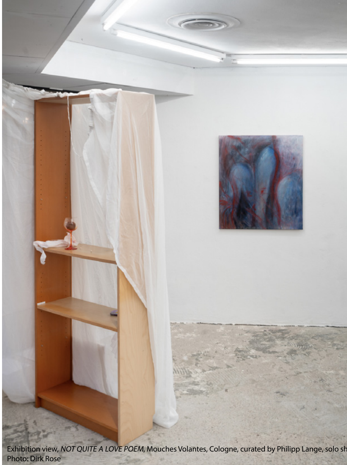
Exhibition view, NOT QUITE A LOVE POEM , Mouches Volantes, Cologne, curated by Philipp Lange, solo show.